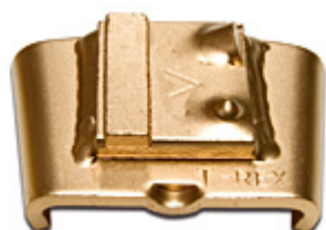
EZ T-Rex™ Dome A, Protect segment (Item Number: 211567)

The ultimate tool for stripping and coarse-grinding.