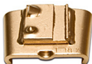
EZ T-Rex™ Dome B (Item Number: 211569)

The ultimate tool for stripping and coarse-grinding equipped with a runner guard.