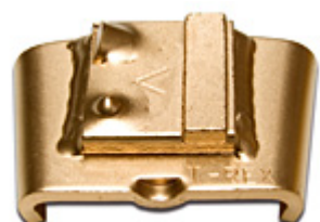
EZ T-Rex™ Dome B, Protect segment (Item Number: 211568)

The ultimate tool for stripping and coarse-grinding. The B version is produced for the HDX machine's anti-rotating tool holder.